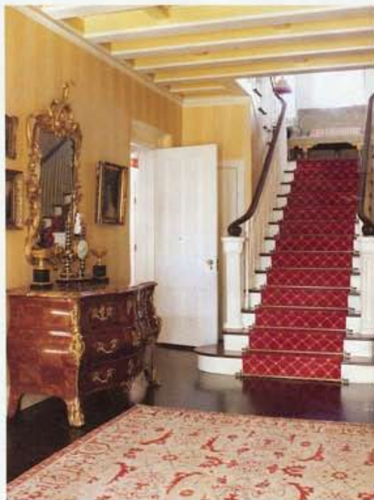
GRAND ENTRANCE: The striking, beamed-ceiling foyer showcases several significant antiques. The French Kingwood commode, along with the mirror and clock, are mid-eighteenth century. The settee atop the stairs is a George II giltwood (gold-leafed) piece that's been reupholstered several times.