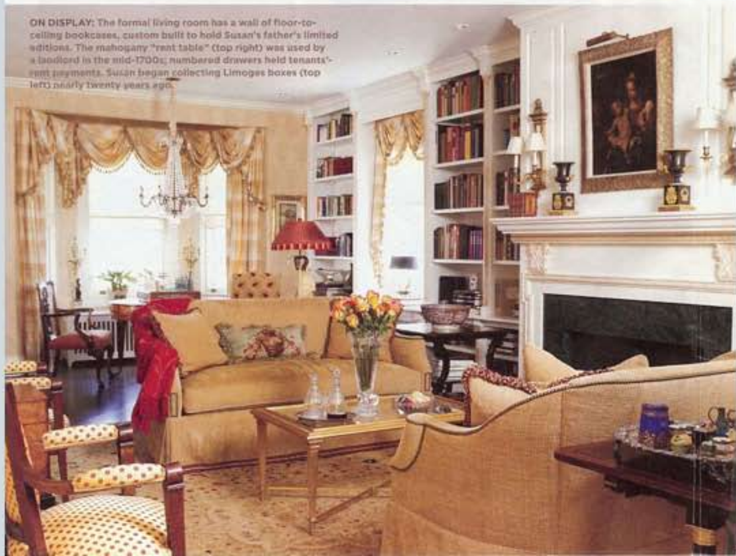
ON DISPLAY: The formal living room has a wall of floor-to-ceiling bookcases, custom built to hold Susan's father's limited editions. The mahogany "rent table" (top right) was used by a landlord in the mid-1700s; numbered drawers held tenants' rent payments. Susan began collecting Limoges boxes (top left) nearly twenty years ago.

TRADITIONAL UPDATE: The design of the kitchen is decidedly old-world, with a mix of cabinet finishes and an elaborate tile backsplash. The eye-catching farmhouse sink (top left) features a bronzed facade. The butler's pantry (below) was built in an existing hallway and crafted to look as though it has always been there.